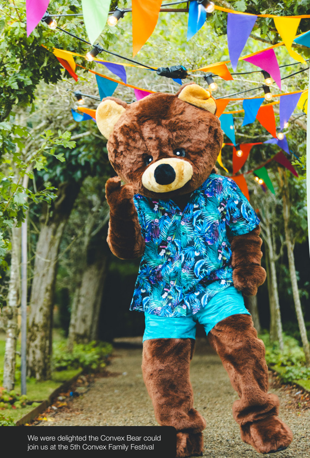
We were delighted the Convex Bear could join us at the 5th Convex Family Festival